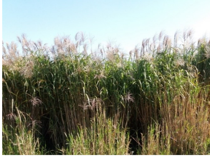
Figure 1. Miscanthus x giganteus at the Futura faculty field

Various literature references mention the use of lignocellulosic plant species in construction materials as constructional, non-constructional or thermal insulation materials, which indicates possibilities for the use of miscanthus for similar purposes [7-14]. Another reason is the growing demand for environmentally friendly building materials imposing. Reinforcement of building materials with natural fibers was reported in the 1990s [29]. It was shown that fibers originating from agriculture, with a lignocellulosic composition like miscanthus, can be used alone or to strengthen materials of different origins (earth materials and cement composites) [9]. The advantages of natural fibers are their wide distribution in the environment, satisfactory physical and mechanical performances [10], as well as possibilities for production from renewable sources or waste biomass. Based on the specific properties of these materials, primarily low density, and compressive strength, they can be compared to materials based on artificial fibers [11].