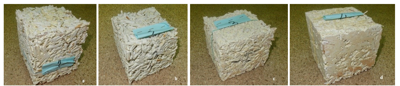
Figure 3. Samples after drying for 14 days obtained in four experimental series: a) 1, b) 2, c) 3, d) 4

After seven days of drying in the molds, the molds were disassembled and the samples were left to dry for another seven days (14 days in total) (Fig. 3), after which the characterization tests were performed [19].