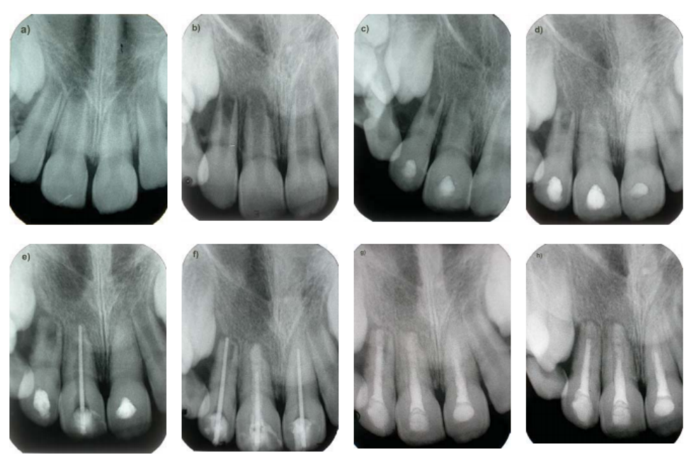
Figure 3. a) Radiographic view of the teeth immediately after trauma, b) Radiographic view after 2 months; c) Radiographic view after 4 months of calcium hydroxide dressing, d) Radiographic view after 6 months of calcium hydroxide dressing, e) Odontometry of the first upper right incisor, f) Odontometry of the first left upper incisor and second upper right incisor, g) Definitive obturation of the injured teeth with MTA Angelus, the application of root canal sealer and guttapercha; h) Radigraphic followup after 6 months of MTA angelus treatment. (Reproduced from [109])

The case report of 4 treated maxillary incisors with apical pathology and unfinished root growth treated using experimental nano-CS cement apical plug revealed a good success rate upon 6 months [109].